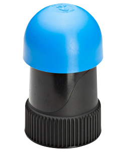
2" & 3" GUARDIAN Air & Vacuum Air Vent