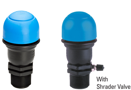
3/4" & 1" GUARDIAN Air & Vacuum Air Vent

PROVEN DESIGN PROVIDES MORE AIR RELEASE CAPACITY THAN OTHER VENTS OF SIMILAR SIZES