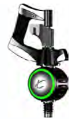
Orbita PC 55 l/h