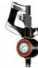
Orbita PC 30 l/h