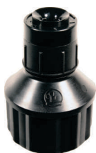
Spectrum™ Thread 1/2" FNPT