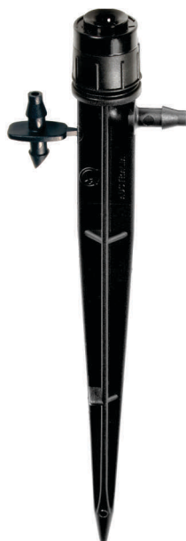
Spectrum™ Spike with 0.16" Inlet and Adapter