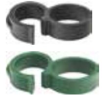
Figure 8 End Closures